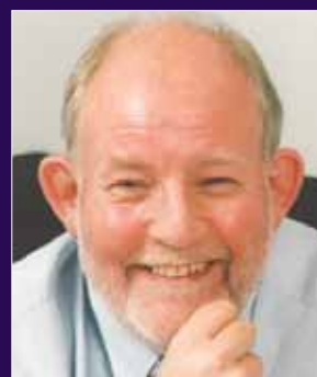
Rt Hon Charles Clarke MP